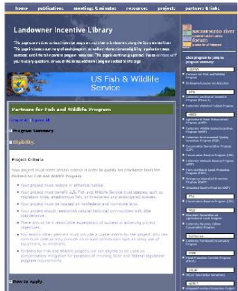
Landowner Resources page of SRCAF website