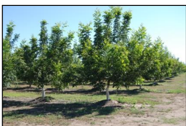
Walnut orchard, Tehama County