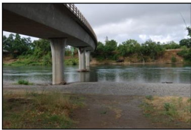
Woodson Bridge, Tehama County