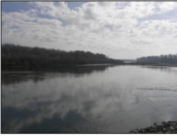
Near RM 182