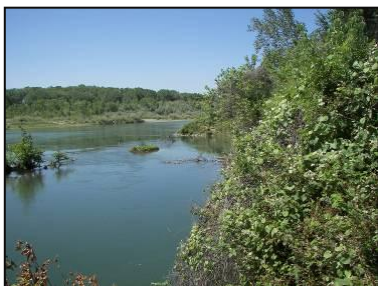
River view - unknown RM